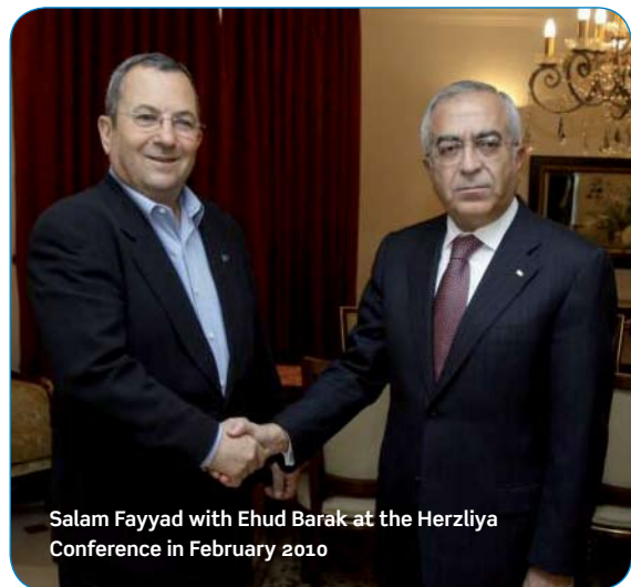
Salam Fayyad with Ehud Barak at the Herzliya Conference in February 2010

Again, the assumption in the UK press that common ground between Israel and the Palestinians is to be treated with extreme caution prevailed; the mere fact that the Israelis were willing to 'do business' with Fayyad seemed to be enough to disqualify him from respectful treatment from the Middle East correspondent. This contrasts greatly with the US approach illustrated in Joe Klein's October 2009 Time Magazine piece in which he portrayed Israeli-Palestinian co-operation in positive terms.